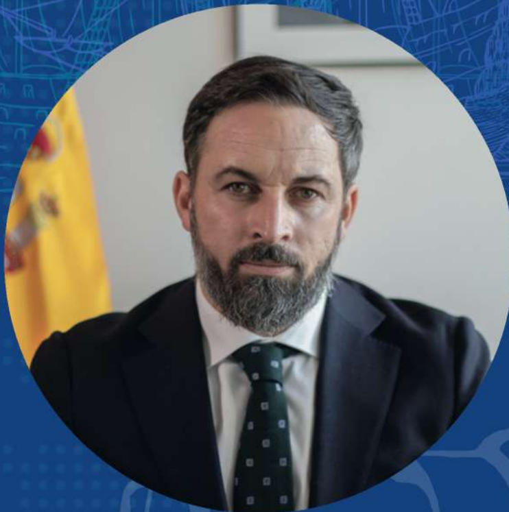
Santiago Abascal Conde President of VOX